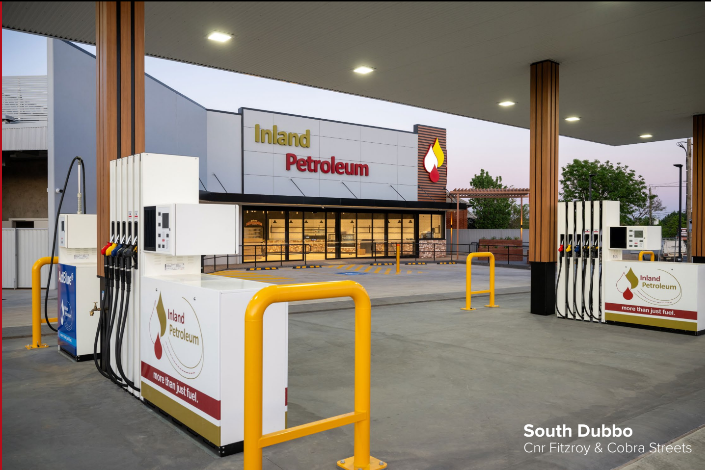
South Dubbo Cnr Fitzroy & Cobra Streets